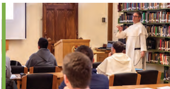
A class in the Aula

During the tutorial, students have the opportunity to discuss in great depth with their tutors the work that they have prepared. The system is challenging and pushes them to the limits of their abilities, but every year our visiting students identify this tailored learning to be the most rewarding and productive aspect of their Oxford experience. Although some visiting students initially find the tutorials daunting, we select only students who we are confident will flourish under this system of learning.