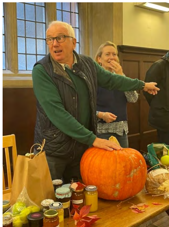
Left: A still-life of autumnal bounty on the altar before being auctioned in support of BOAT in October. Right: BOAT's annual Harvest Auction was back in action, with delicious offerings and lively bidding!