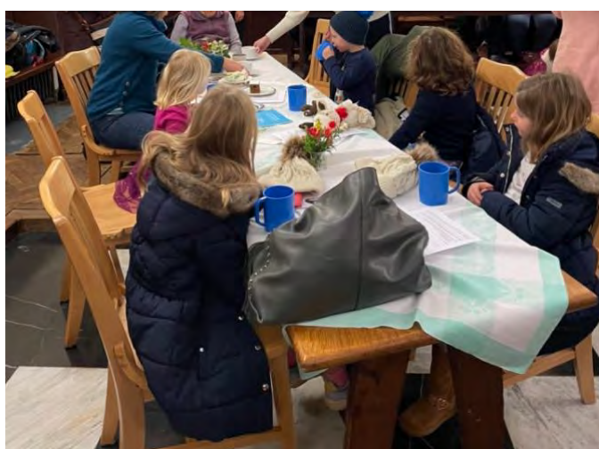
Left: Cakes, fresh bread, Christmas biscuits and real mistletoe were donated to BOAT's Advent Café. Right: Events like the Advent Café foster a sense of community, as well as support BOAT's work.